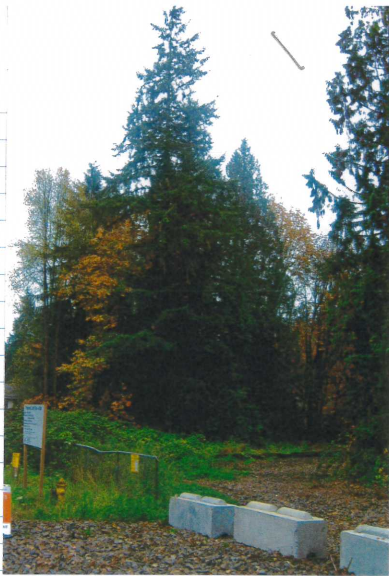
ONE SIGNIFICANT TREE